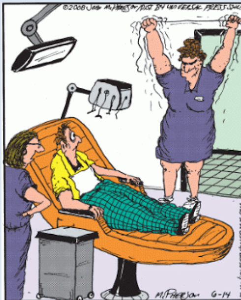
"We call her 'The Plaque-inator.' She takes on the tough cleaning jobs when we have people like you who haven't flossed in six months."