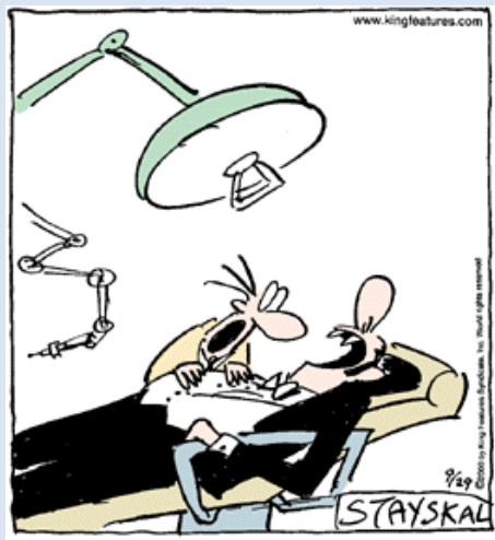
"If you don't let me file down those incisors, Mr. Dracula, you'll never stop biting your tongue."