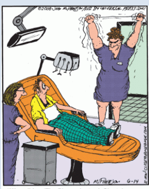
"We call her 'The Plaque-inator.' She takes on the tough cleaning jobs when we have people like you who haven't flossed in six months."