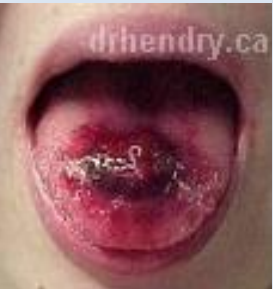
This is infection.